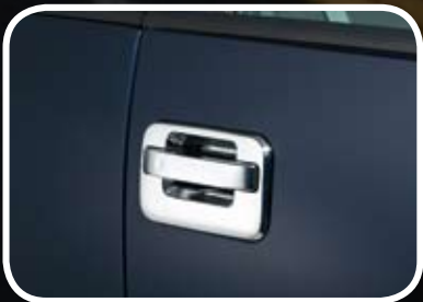
Door Handle Cover