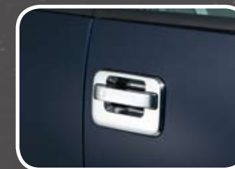
Door Handle Covers

Don't let their good looks fool you. After all, an AVS chrome hood shield provides maximum protection, just like every other AVS hood shield. Our chrome Ventvisors® keep rain out and let fresh air in, just like the original Ventvisor® has been doing for more than 70 years. Add chrome mirror covers, door handle covers, a tailgate handle cover and a fuel door cover, and you are ready to handle anything the road ahead has in store for you ... with style.