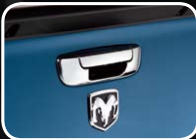
Tailgate Handle Cover