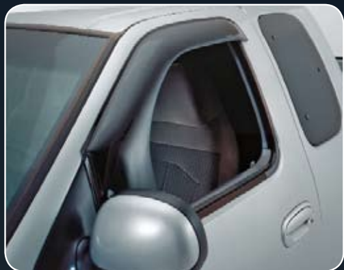
Intended for off-road use