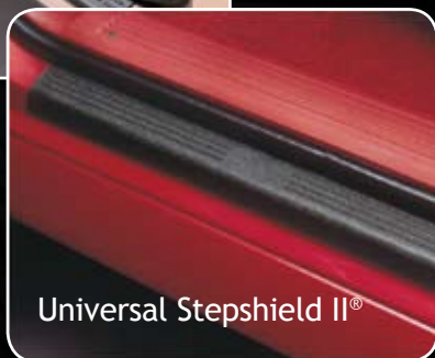
Universal Stepshield II®

Universal Stepshield II® can be trimmed to fit most any vehicle and is available in black