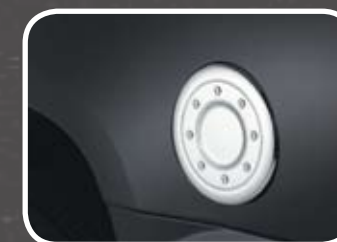
Fuel Door Cover