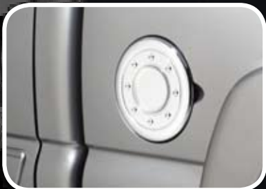
Fuel Door Cover